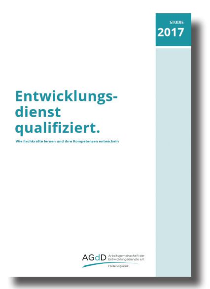
2017, 163 Pages www.agdd.de/studie-2017

In all that we do, we are especially keen to facilitate direct exchange and encounter with (former) development workers – and this is something which we enjoy immensely.